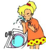
wash our face