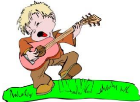
play the guitar