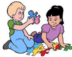
play with my friends