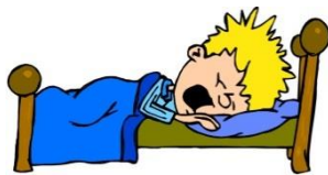
go to bed