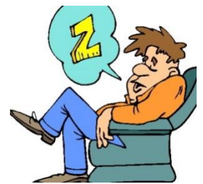
take a nap