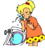
wash our face