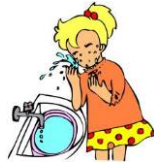
wash our face