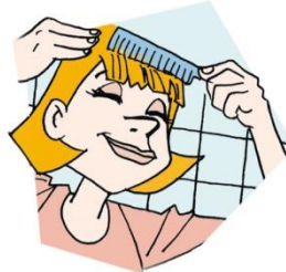
comb my hair