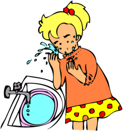
wash my face