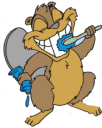
brush my teeth