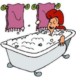
take a bath