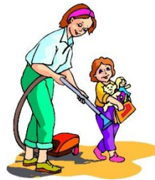
help my mom