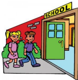
go to kindergarten